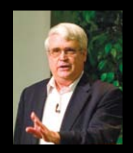
TRANSFER FROM UC TO LLC EXPLAINED PAGE 2